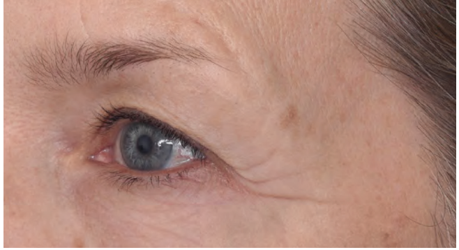
After one Hydrafacial Treatment with Murad Retinol Booster